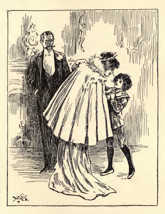
"MISS ROSE PUT HER HANDS ON HIS SHOULDERS"